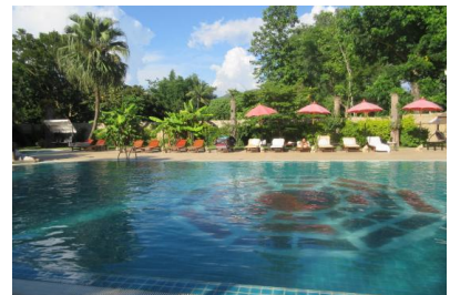
Tao Garden : nature, architecture and art