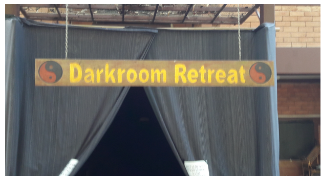
entrance to the dark room